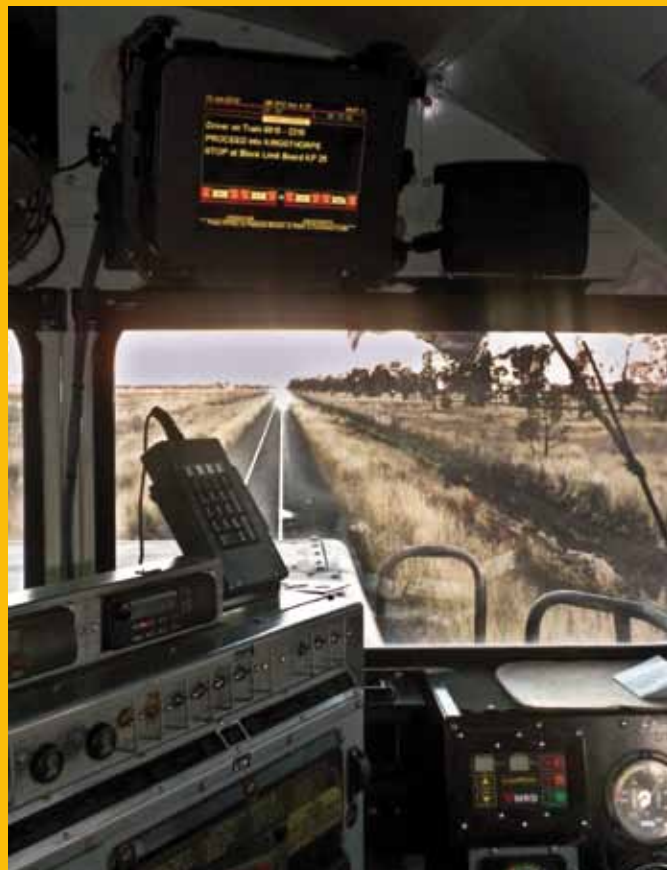
Driver's view: Monitor showing current authority, key pad, microphone and the track ahead.

Driver: 'Control that is correct, Driver 9867 out'